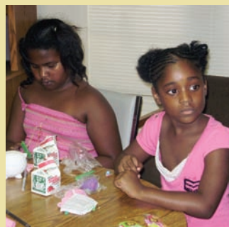
Children at Wilmington House enjoy the free lunches, snacks and playing with friends in the community center.